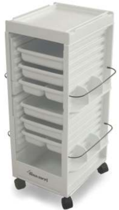
10E NICO MINI (29" high) 20E NICO MAXI (34" high)