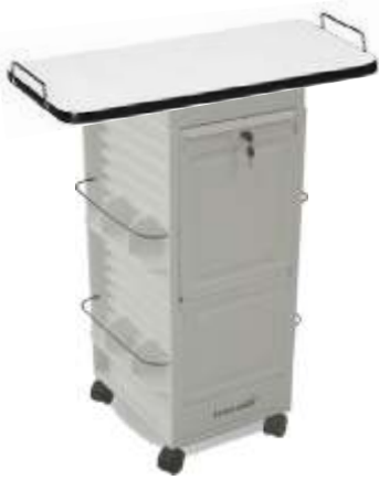
20E NICO shown with 109N laminated top

QUALITY EQUIPMENT PROUDLY MADE IN U.S.A.