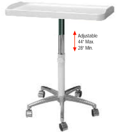
2500E PRACTICO II