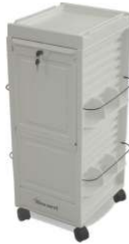
20E NICO shown with 92E lockable door