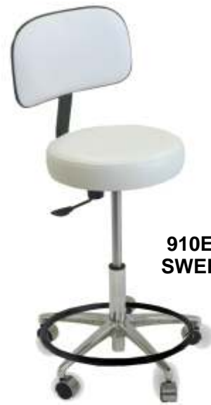
910E SWEET SIT

Dina Meri Esthetic Line chairs and stools features: Durable comfortable vinyl upholstery, steel frame construction, chromed metal 5-leg rolling base for superior stability, chromed casters, hand-operated, gas powered piston 360° swivel seat, which adjust easily from 20" to 28", Fully adjustable back (910 and 920 model only) Custom colors also available