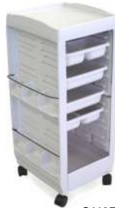
C113E CAPRI OPEN