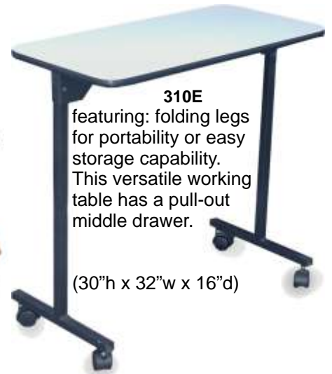
310E featuring: folding legs for portability or easy storage capability. This versatile working table has a pull-out middle drawer.