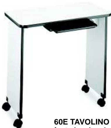
60E TAVOLINO featuring: Laminated top & legs, 1 storage tray, (30"h x 32"w x 16"d)