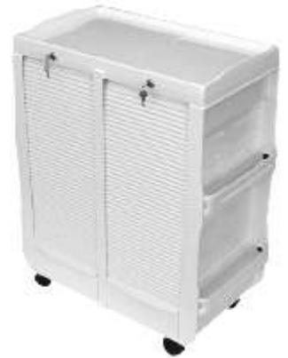
M180E MAGNUM Double the capacity of model C180 (34" h x 28" w x 15" d)