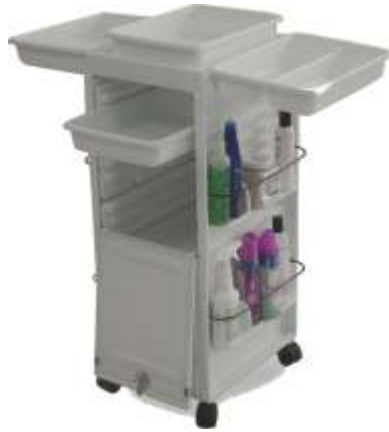
20E NICO shown with 92E lockable door at work.