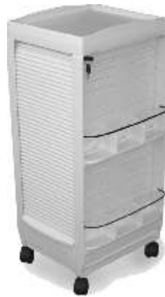
180E CAPRI (34" h) 185E (29" h) 4 trays, 4 side pockets lockable roll-up door (34" h x 17" w x 15" d)